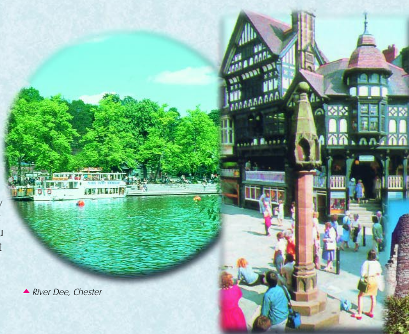
▶ River Dee, Chester