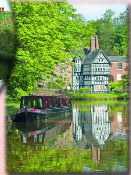
▶ The Packet House at Worsley on the Bridgewater Canal. Not only pretty but has an important place in canal history. It's where the Duke of Bridgewater built the canals to his coalmines.